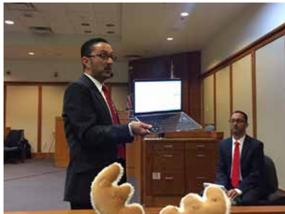
Explaining Realtime to the children

Christmas tree in the lobby, sing carols, and then go to a courtroom to learn about the judicial system, hearing from the judge, a prosecutor, a defense attorney, the bailiffs, and the court reporters. Some years the children are fascinated with the fact that we're twins, oftentimes believing the judge's joke that the Twelfth Judicial Circuit requires all the court reporters to look alike. Other years, the inquiring minds are fascinated with our realtime technology and find the humor in the fact that only we can call